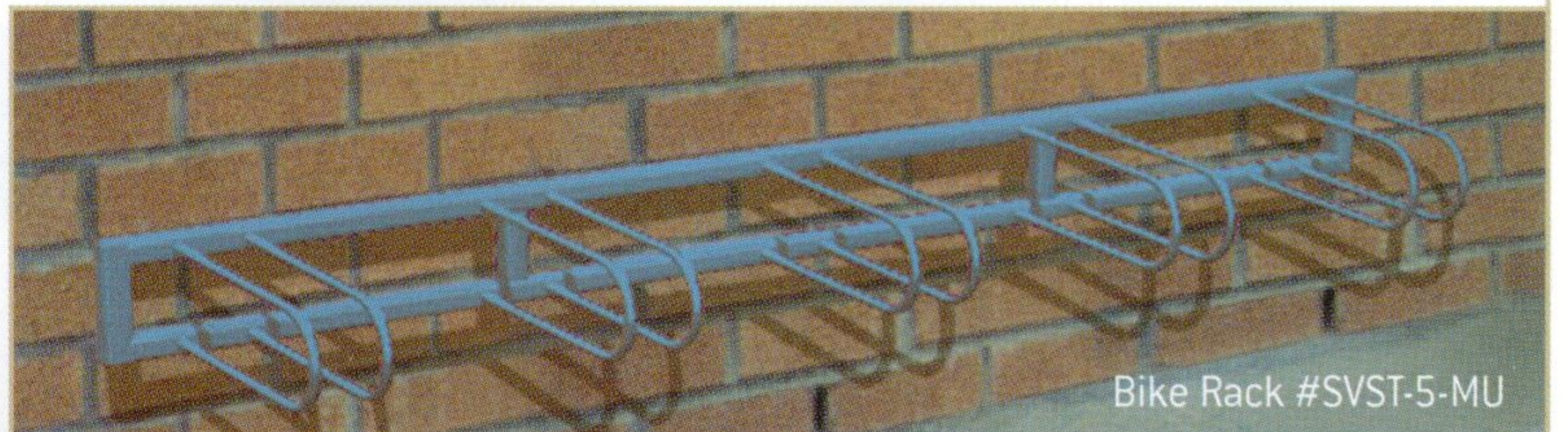
Bike Rack #SVST-5-MU