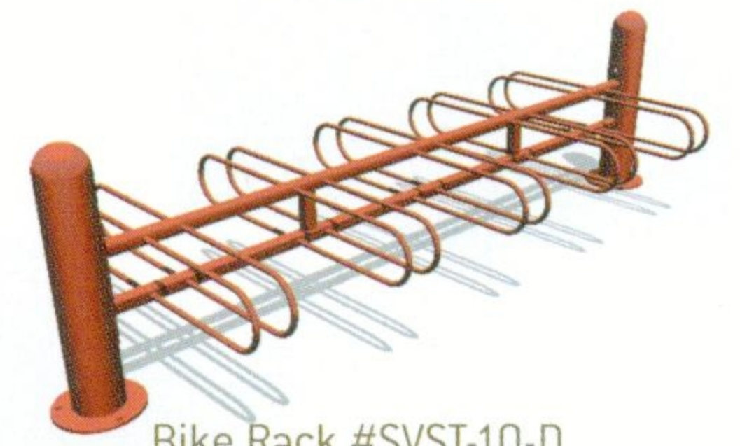
Bike Rack #SVST-10-D