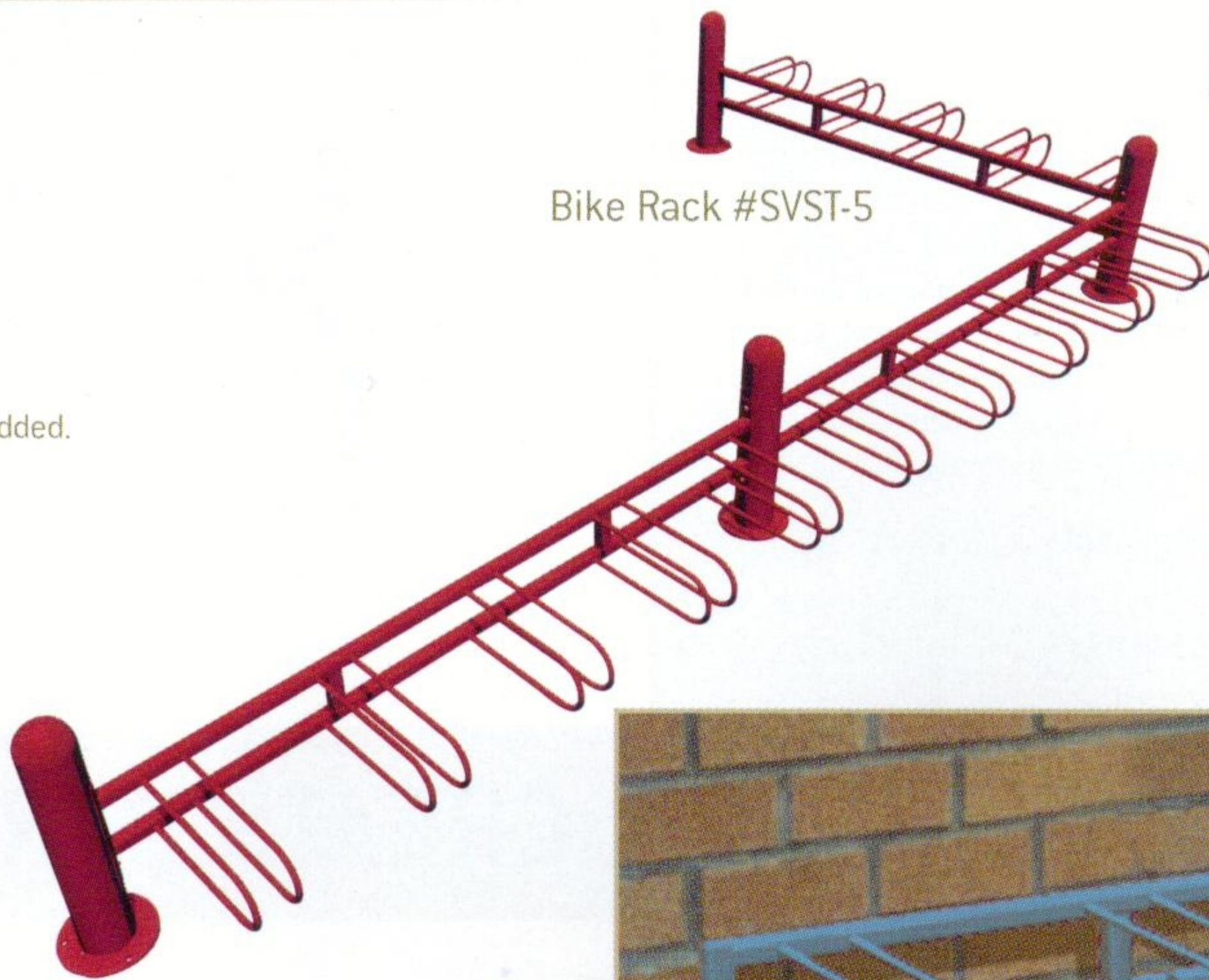
Bike Rack #SVST-5